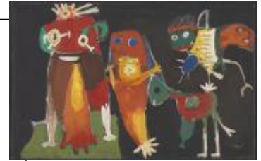
Karel Appel Hip, Hip, Hoorah! 1949