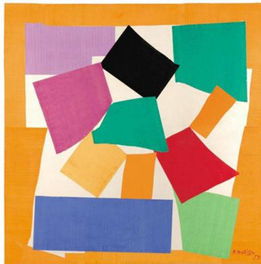
Henri Matisse The Snail, 1953

Circus Skills. Children on green and above enjoyed a circus skills workshop on Thursday. They enjoyed plate spinning, stilt walking and diabolo.