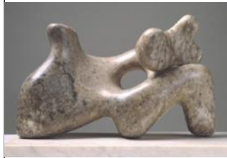
Mother and Child, 1934