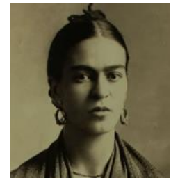
Frida Kahlo 1907-1954