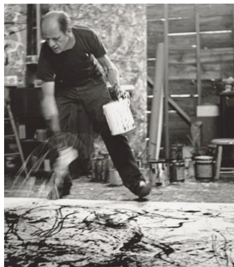
Jackson Pollock, 1950