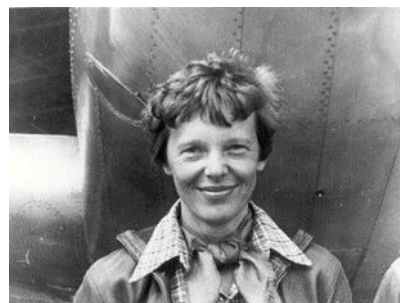
Amelia Earhart 1897-1937