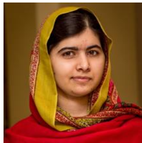
Malala Yousafzai Born: July 12 th , 1997