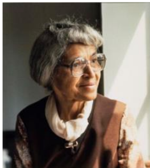
Rosa Parks 1913-2005

Rosa Parks was a heroine of the black community. While she didn't do it alone, her actions sparked a fire that led to great changes.