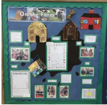
Nursery: On the Farm

Each year group has showcased the work they have done from last half-term in regards to their topic curriculum boards. We want to share the wonderful work your children have produced as well as sharing the great efforts your child's teaching team have done in putting them up. This week the school councillors and well-being councillors have judged the information displayed and the presentation of the boards in a friendly staff competition.