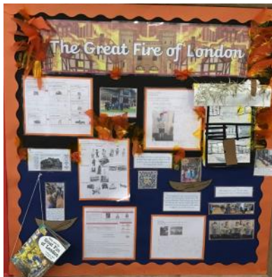
Year 2: The Great Fire of London