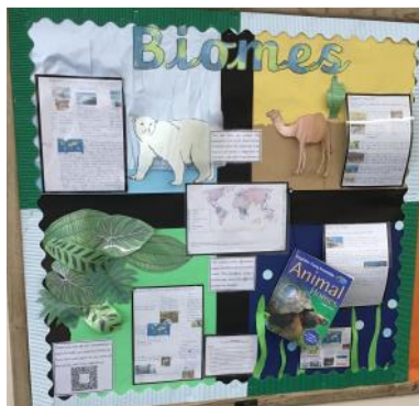
Year 5: Biomes