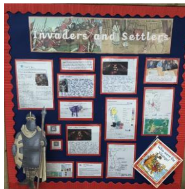
Year 3: Invaders and Settlers