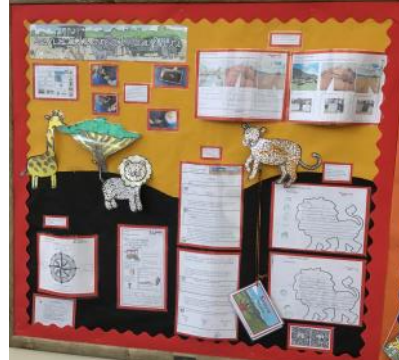
Year 1: Sensational Safari