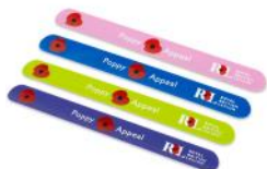
Snap Bands £3

When we return on Monday 6th November we will be selling Poppies and other items for the Remembrance Day Poppy Appeal. If you would like any items please bring money into class and pass to your Teaching Assistant who will come to the office to collect.