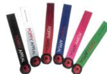
Zip pull 50p