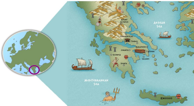
A Map of Ancient Greece

The Olympic Games began in 776 BC in Olympia. They were held in honour of the Greek God, Zeus..